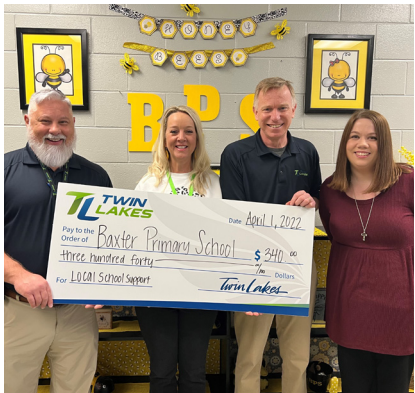
Baxter Primary School