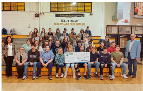
Pickett County High School