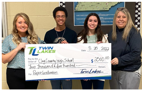
Clay County High School