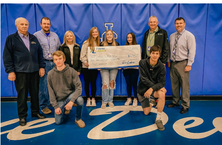
Jackson County High School

Twin Lakes recently visited with each high school in our service area to present the graduating seniors with a $2,500.00 check to be used for Project Graduation. Project Graduation is an overnight event the seniors participate in as their class gathers for one last time. Numerous items are given to the students during Project Graduation as a gift for their accomplishments and hard work over the past four years. This occasion has been taking place for several years to give the students an award and a safe place to gather and say their good-byes. Twin Lakes is proud to sponsor this event and would like to congratulate the Class of 2022 and wish them the best on their next chapter in life.