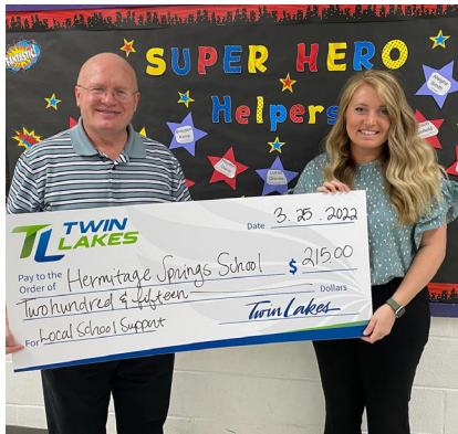
Hermitage Springs School